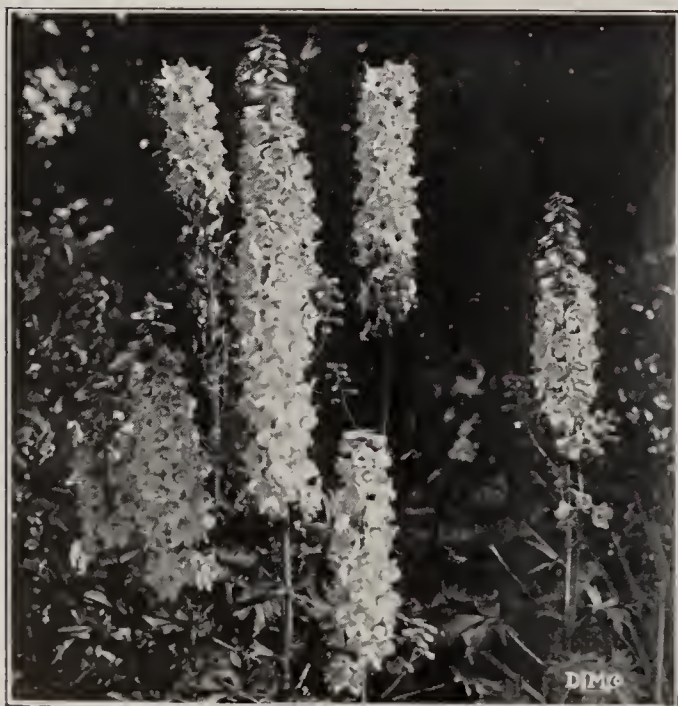
BLACKMORE & LANGDON'S ENGLISH HYBRID

Wrexham Deep Blue Shades. 35c. each, $2.50 per 10, $18.00 per 100.